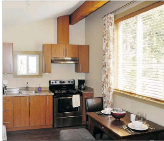
The functional kitchen within one of the homes.